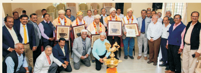
"Guru Vandana" by ABC-75 batch