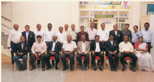
Newly elected EC members along with outgoing EC members of the Alumni Association