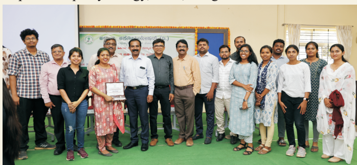
The Dignitaries along with Pratibha Puraskar Awardees

“INSPIRE Faculty Award” instituted by the DST, Govt. of India, New Delhi.