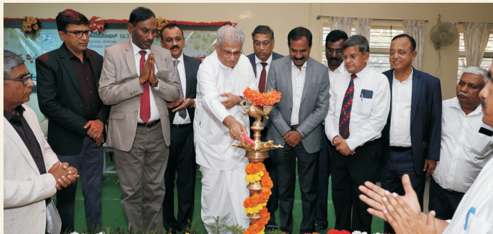
Dr. D. Veerendra Heggade inaugurating the programme by lighting the lamp

The Alumni Association organised felicitation programme to New Vice-Chancellors of Farm Universities of Karnataka on February 22, 2023. Dr. D. Veerendra Heggade, Philanthropist and Dharmadhikari of Shrikrishetra Dharmasthala and Member of Parliament (Rajya Sabha) inaugurated the programme.